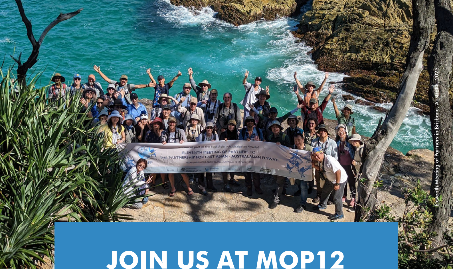
Eleventh Meeting of Partners in Brisbane, Australia, 2023