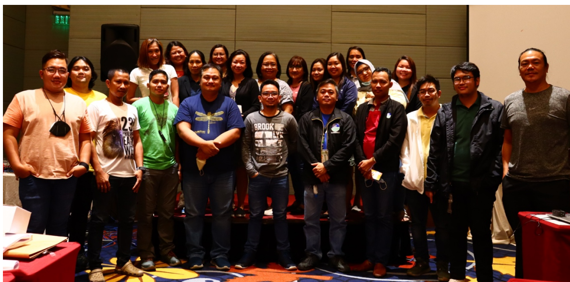
On-site participants of the 1st National Seabird Identification and Monitoring Training in Quezon City.