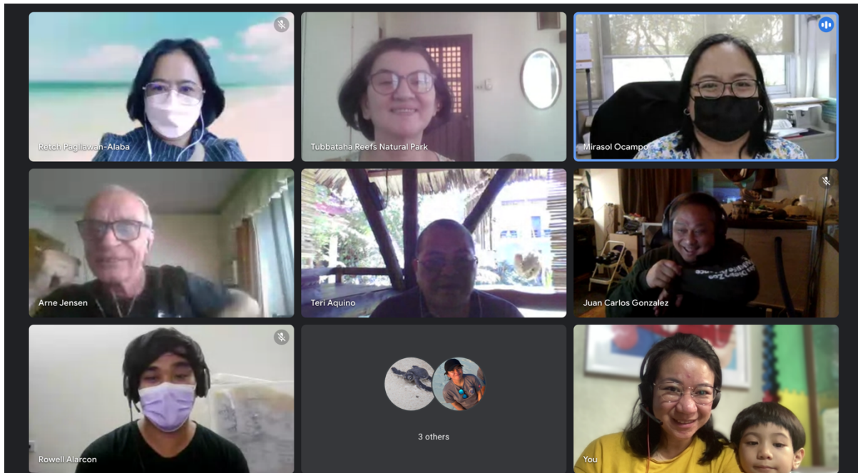
Members of the Seabird Forum Core Group during the validation meeting held via Google Meet.

The Seabird Research and Conservation Strategy for the Philippines highlights 5 core thematic areas, which shall be the focus of activities in the next 5 years: